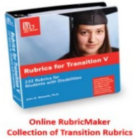
Rubrics for Transition RubricMaker Online License