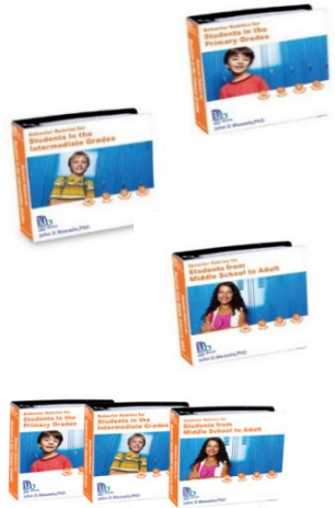
3 Behavior Rubric Manuals (K-Adult)